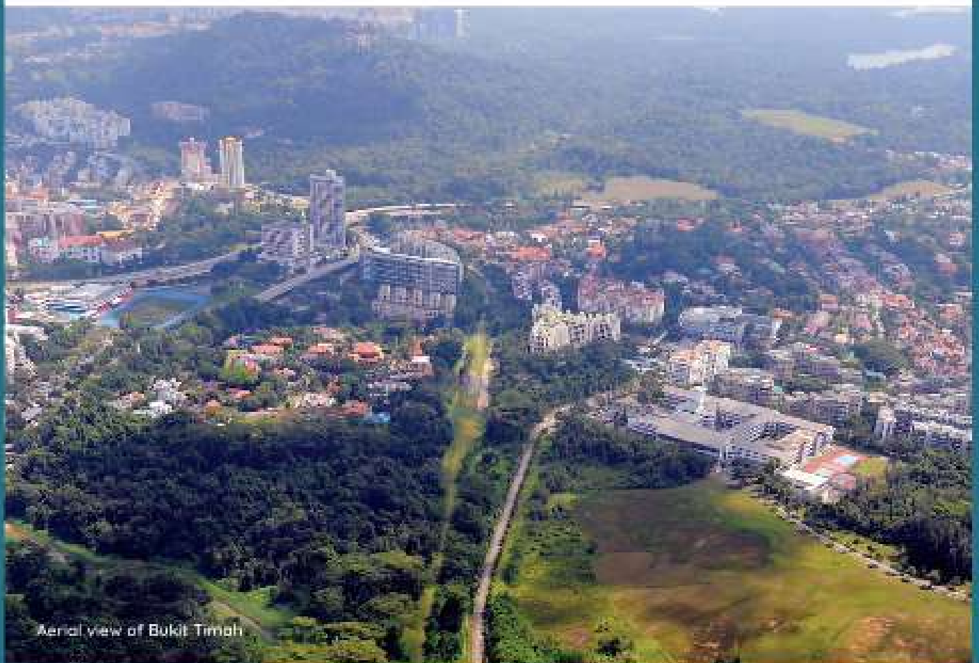
Aerial view of Bukit Timah

Our towns are planned to be liveable and self-sufficient, with easily accessible shops, health care, schools, community facilities and parks. Commercial nodes, industrial estates and business parks within or nearby the town, also help to provide nearer job opportunities for residents. The detailed planning and implementation of plans for each town is a joint effort of many government agencies.